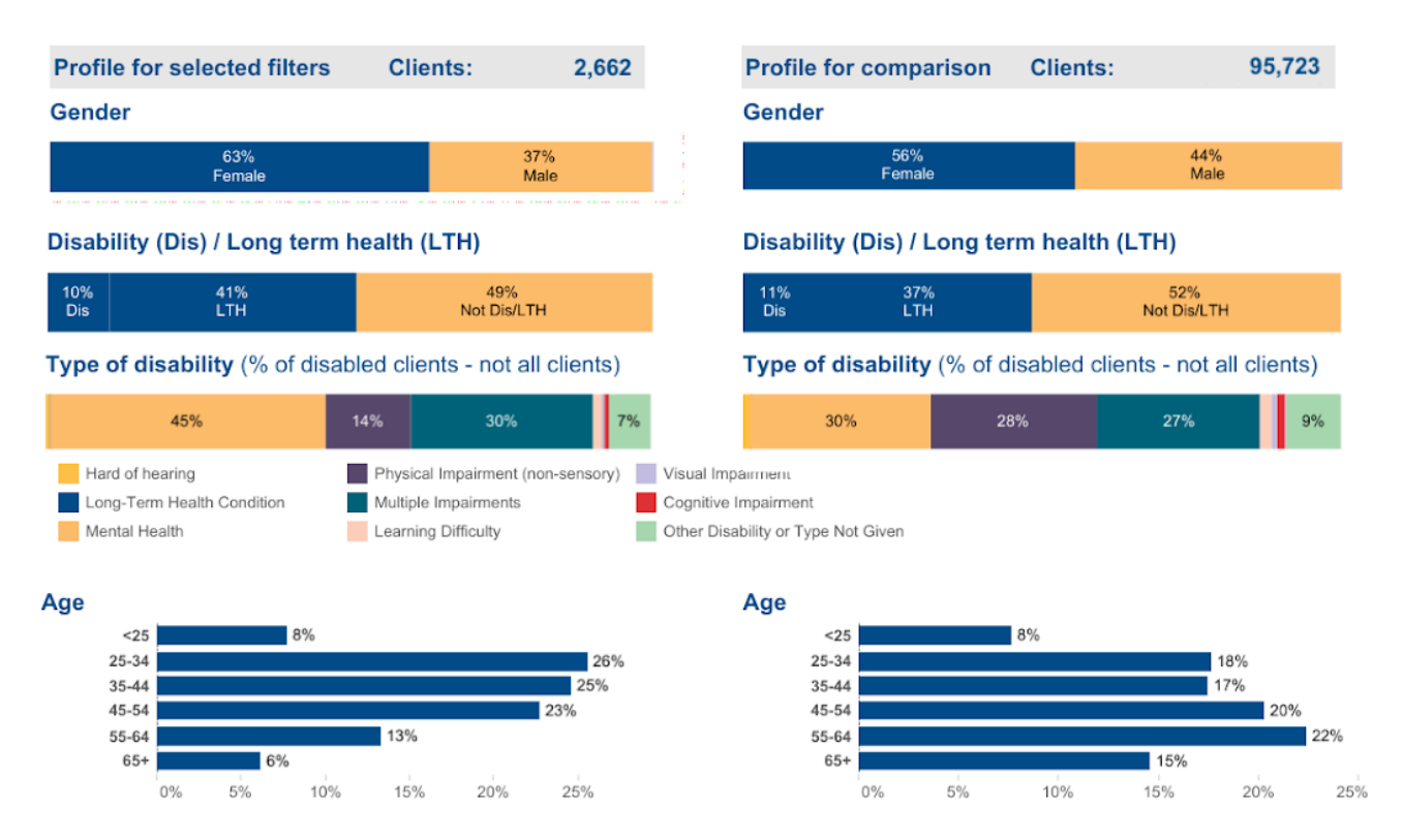
Fig. 2 shows the breakdown of client demographics, with client demographics of clients with fuel debt issues on the left, compared to the average client demographics in Wales on the right.

The data also suggests clients who come to us about fuel debts are more likely to be female, younger and/or suffer from mental health problems<sup>5</sup> than the average Citizens Advice client in Wales.